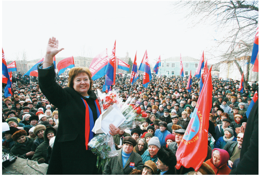
Natalia Vitrenko at a rally of her party, the Progressive Socialist Party of Ukraine.

citing SBU “suspicions” about Vitrenko’s receiving money from the Russian Foreign Ministry-run Fund for the Support and Defense of the Rights of Compatriots Residing Abroad. The allegations date to May 2014, when the bank accounts of Gift of Life were frozen. According to Ukrainian media, this was done “in the framework of an SBU investigation of funds transfers through Ukrinbank, intended for persons suspected of infringement of the territorial integrity and inviolability of Ukraine.” A flood of media reports named Vitrenko as a major sponsor of separatists and terrorists, which are broad categories used by the current Ukrainian authorities against their political opponents.