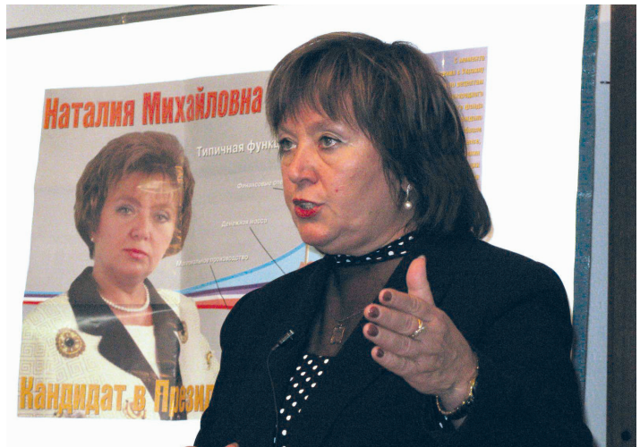
Natalia Vitrenko, doctor of economics, is chairman of the Progressive Socialist Party of Ukraine, has served in Parliament, and run for President.

Meanwhile, in Ukraine, Dr. Natalia Vitrenko, the