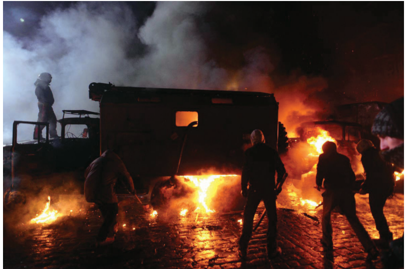
Blazing barricades in Kiev, Jan. 19, 2014. Western press coverage almost universally attributed the violence to “police brutality.”

On Jan. 1, the second violent escalation took place. Three days after measures were put through the Parlia-